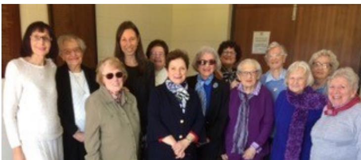
Some of our Shalom Group Members, July 2019

The MZH residents look forward to seeing the Reading Out Loud Volunteers on a weekly or fortnightly basis.